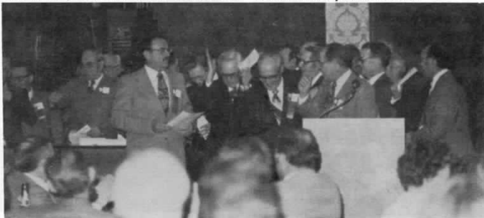
The '50 College class gets set for the Anvil chorus at the 'Grand Do'.

singing (?). However, they left their mark on the annual meat and potatoes soiree with lusty lungs and even a little harmony, and led the dancing with determination, if not finesse.